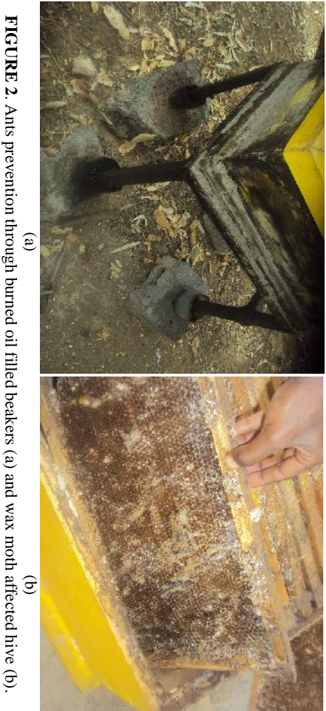
FIGURE 2. Ants prevention through burned oil filled beakers (a) and wax moth affected hive (b).

Where KSG=Knowledge/skill gap, PHA=Pesticides and herbicides application, SBF=Shortage of bee forage, LIQ=Lack of inputs (accessories) and quality, LES=Lack of extension service, SBC=Shortage of bee colony and PAP=Pests and predators