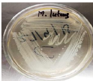
FIGURE 1: Micrococcus luteus

LOD st.s - Limit of detection in standard solution LOD egg - Limit of detection in egg MRL egg - Maximum residue level in egg