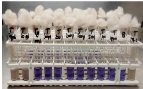
FIGURE 2 : Standardization of Tiamulin to assess LOD